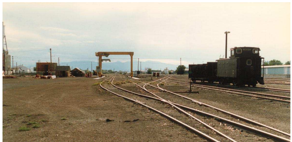
Above; Another view of the Alamosa yards looking west with the little yard buildings, the transfer crane, and a caboose at some time used on the locals to South Fork or Antonito. Even part of the dual gauge tracks that once made this yard so interesting still remains on some sidings.