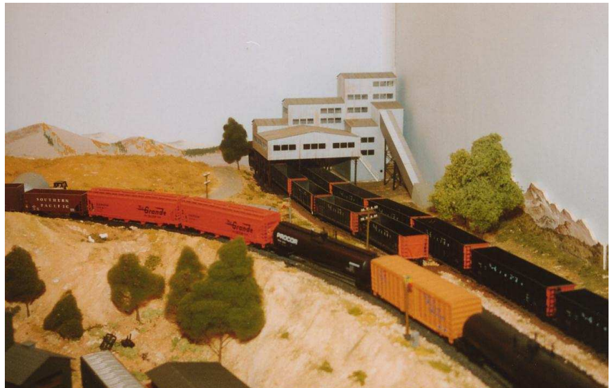
Above; The original layout before the top deck was built. Below; The same area with part of the Alamosa yards visible on the top deck. The coal mine became a casualty of the rebuilding.