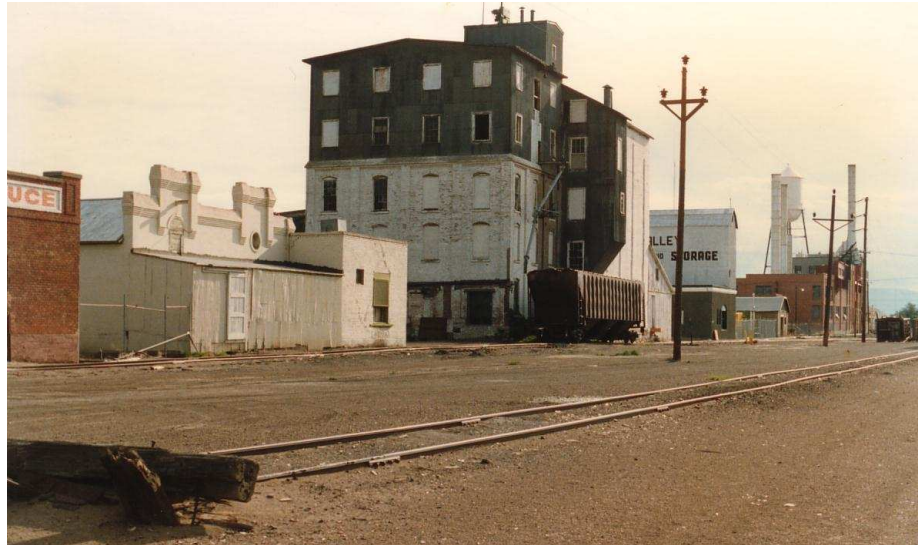
Above; The Alamosa yards looking west and the industries served by the railroad in 1988.