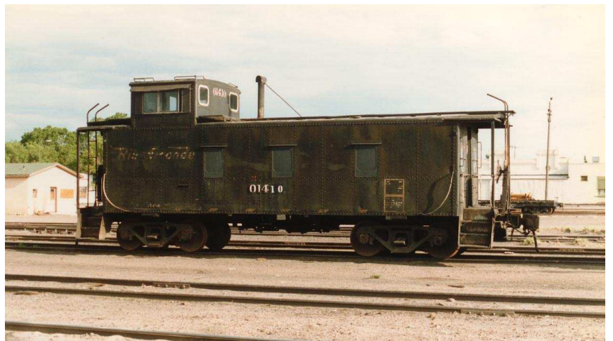
Above; Caboose 01410 sitting in the yards at Alamosa. Judging from the rust on the wheels it had not been used for some time.

Below; The loco re-fuelling plant at Alamosa. Left; The sanding facility at Alamosa. Both of these railroad structures would make ideal prototypes for modeling purposes.