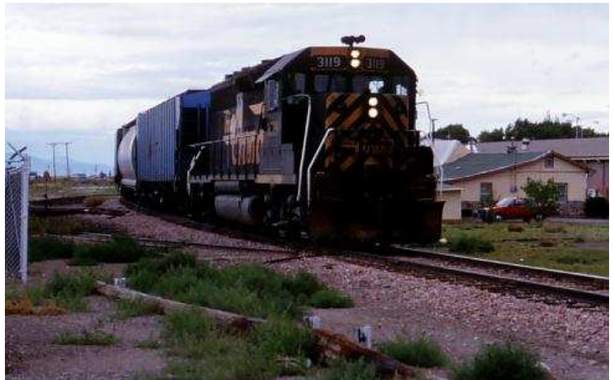
Above; The local from South Fork hauled by GP 40-2 3119 about to enter the yard at Alamosa. Note that several track switches have been removed.