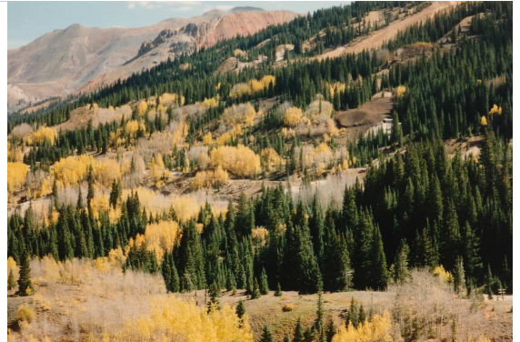
Nature's Grande Gold.

that we found a large plant operated by Staley which was located on a short spur from the mainline.