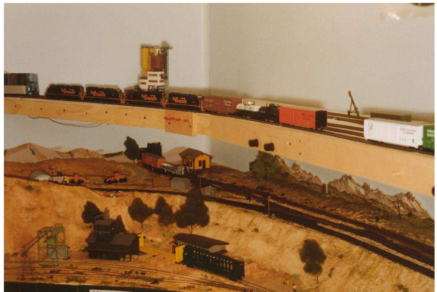
Right; A view of the Alamosa yards looking towards the location of the power house. Several of the tracks have been widely spaced in a effort to copy a feature of the prototype.